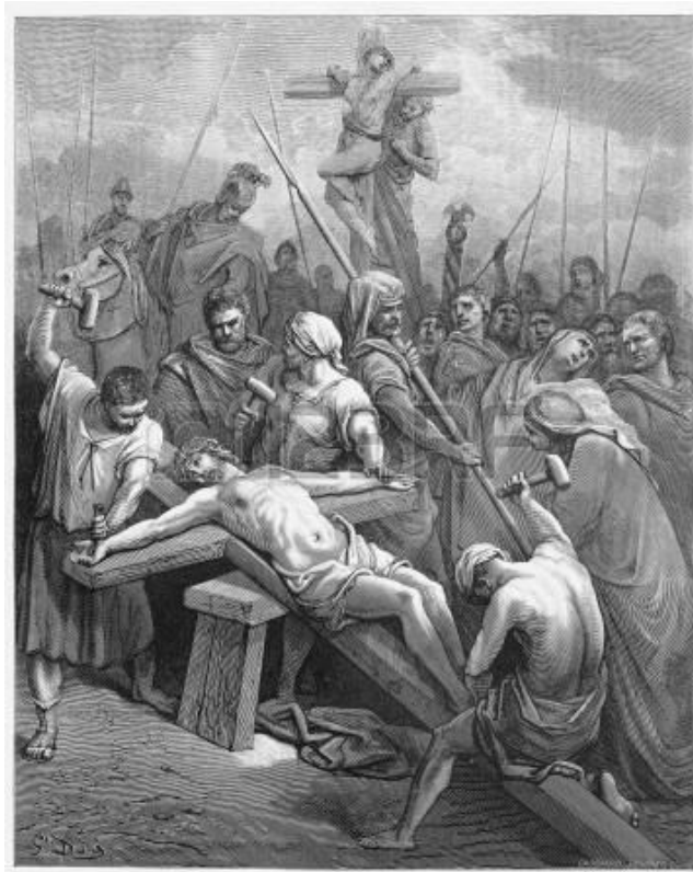
Jesus Is Nailed to the Cross -. Gustave Dore (1885),

The Parish of Holy Cross Choral Services Lent Term 2017