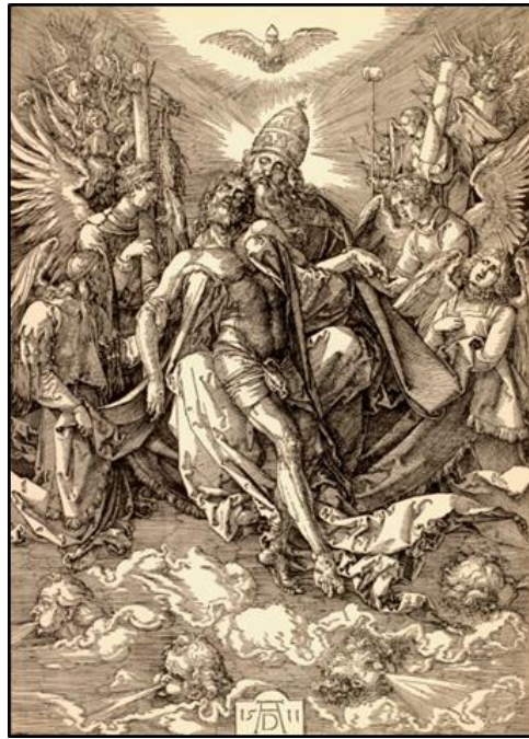
The Holy Trinity 1511 - Albrecht Dürer